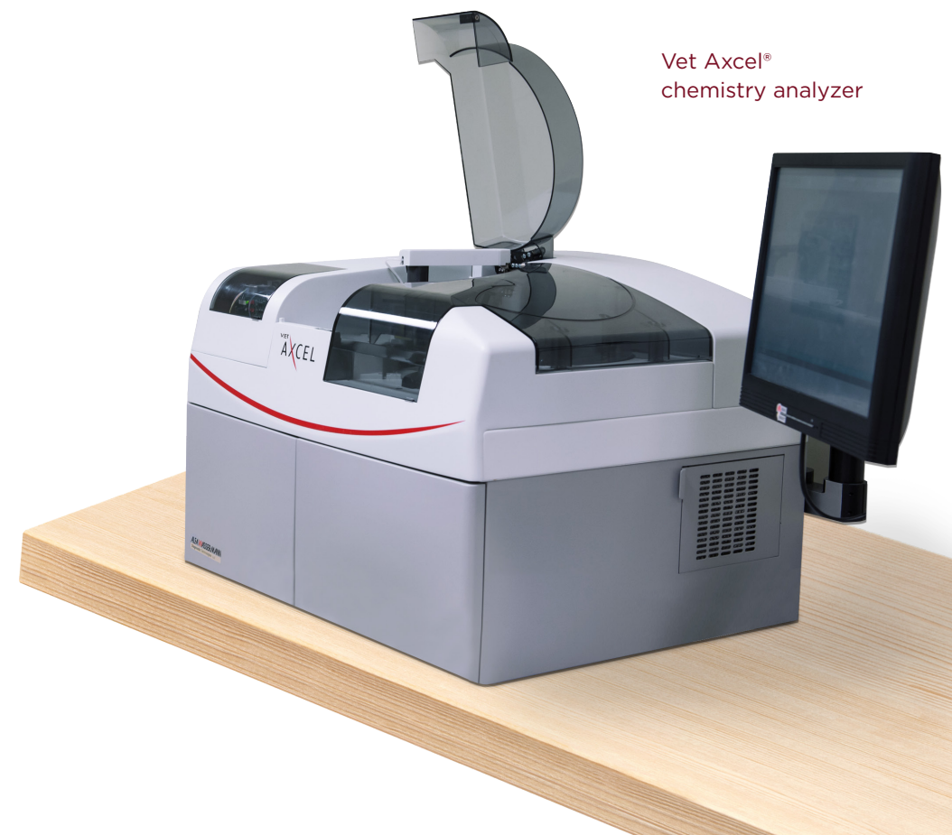
Vet Axcel® chemistry analyzer